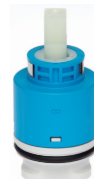
Cartridge with distributor