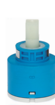
Cartridge without distributor