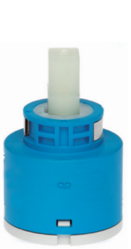
Cartridge without distributor. Specially designed for kitchen applications